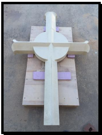
The new cross in progress

The second event is Sunday, November 22 nd at 4:00 p.m. we are invited to enjoy a performance by the Baylor Chamber Choir. The choir will perform in the historic Independence Baptist Church. Independence Baptist Church is the oldest continuously active Baptist church in the State of Texas, the church was organized in 1839 and it was in this congregation that Sam Houston was baptized.